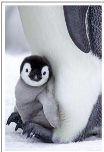
Emperor Penguin and chick at Snow Hill Island, Antarctica Canon EOS-1D Mark III Canon 500 mm with 1.4x f6.7 1/1000 ISO 400