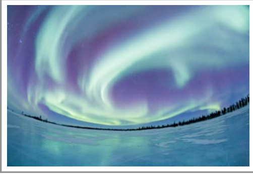
Chesney Manitoba Canada Northern Lights light up the sky and the frozen lake below Canon EOS-1DS Mark III Canon 15 mm fisheye f5 68 seconds ISO 1250